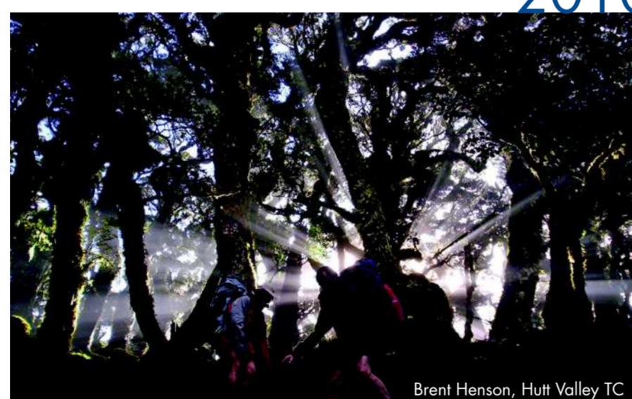
Brent Henson, Hutt Valley TC

FMC was largely comfortable with the direction proposed in this plan. FMC submitted on a number of aspects of interest to recreationalists in the lower North Island.