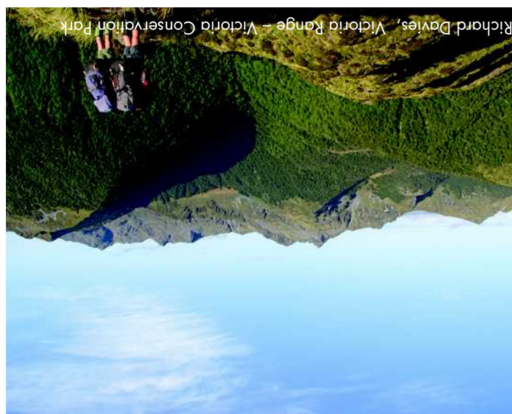
Victoria Range – Victoria Conservation Park